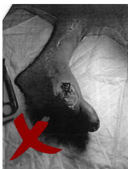
Figure 1: Unnecessary items and a clutter background (Kentorp, N, Sår (2) 2013)